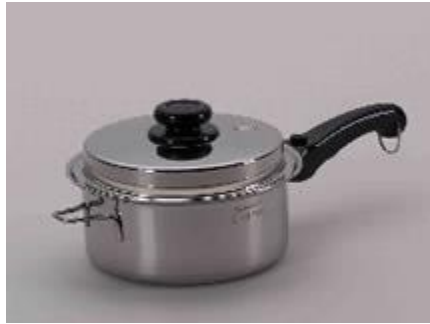
3 Qt / 2.8 L