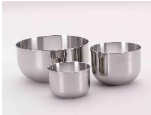
3 Piece Bowl Set