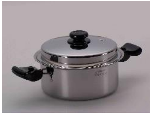
5 Qt Roaster / 4.7 L