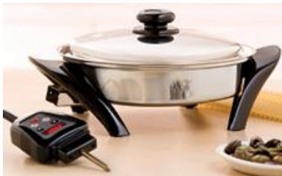
10" Oil Core Skillet