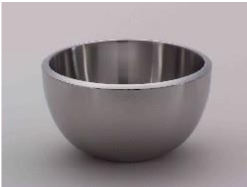
5 Qt Thermal Bowl