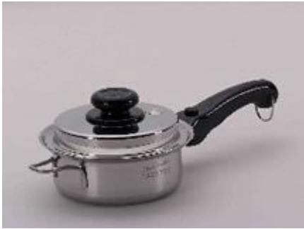
1 Qt / .9 L