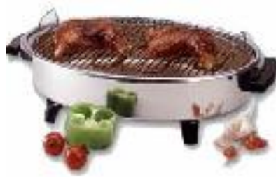
Indoor Smokeless Grill