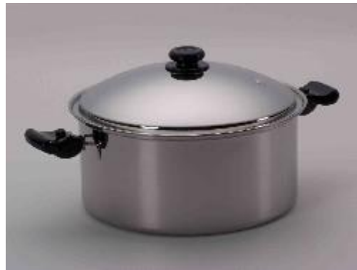
16 Qt Roaster / 15.1 L