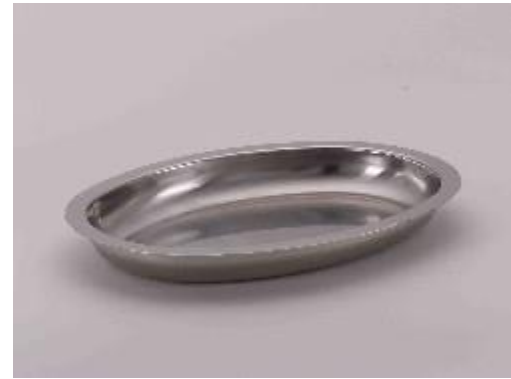
16 1/2" X 12" Oval Serving / Baking Dish