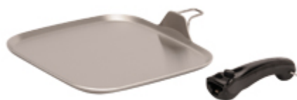
11" Square Griddle