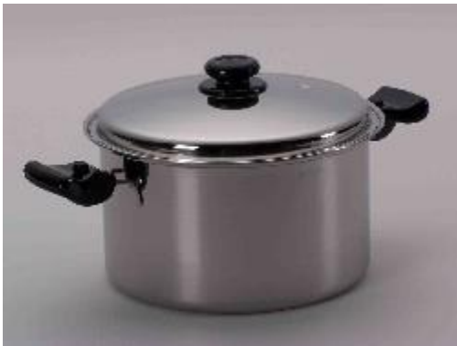
10 Qt Roaster / 9.5 L