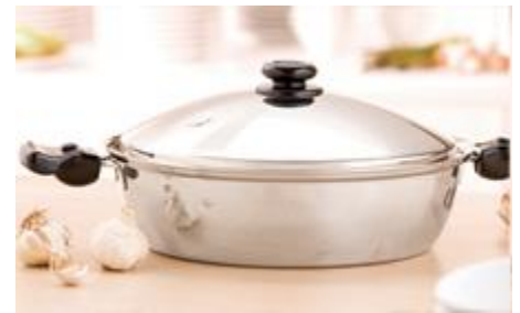
9 Qt Braiser / 8.5 L