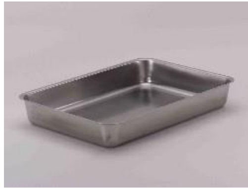
9" X 13" Bake & Roast Pan