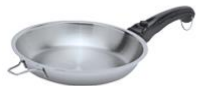
10.5" Chef's Skillet