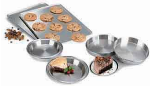
6 Piece Bakeset