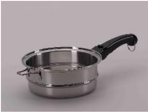
3 Qt Inset / 2.8 L