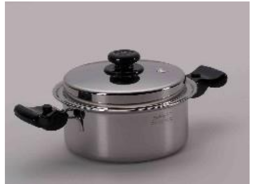
4 Qt / 3.8 L