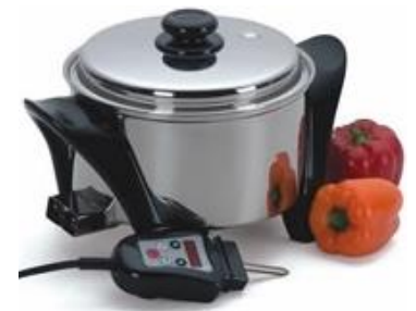
Multi-Purpose 5 Qt