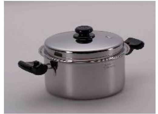
7 Qt Roaster / 6.6 L