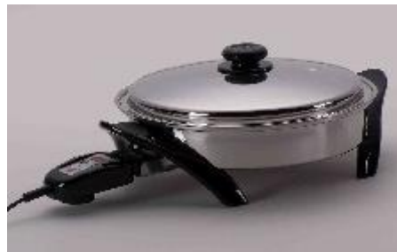
12" Oil Core Skillet